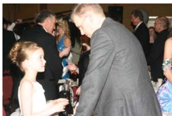
A girl and her dad make their pledges